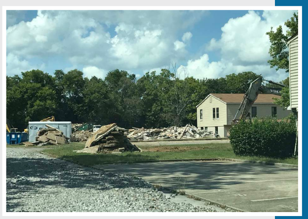
Demolition of Cherokee opens the door for redevelopment.